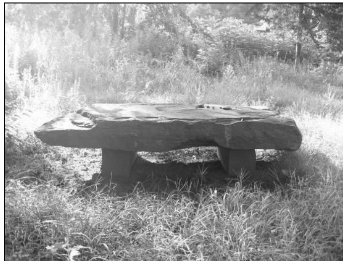
Troderman Memorial Bench